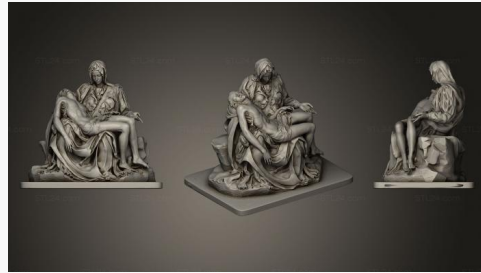
STKRL 0080 → 2500P