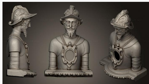
STKRL 0128 → 2500P