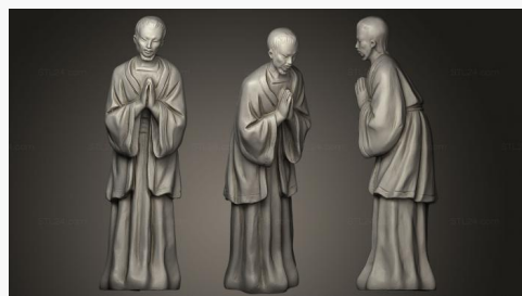
STKRL 0072 → 2500P