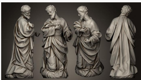
STKRL 0134 → 2500P