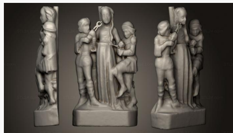
STKRL 0148 → 2500P