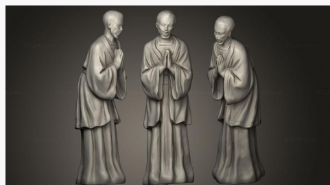
STKRL 0002 → 2900₽