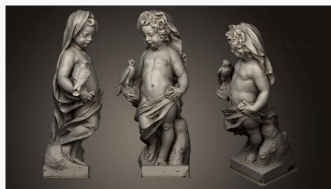
STKRL 0125 → 2500P