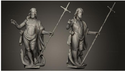
STKRL 0047 → 2900₽