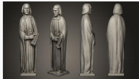
STKRL 0102 → 2500P