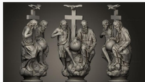
STKRL 0051 → 7600₽