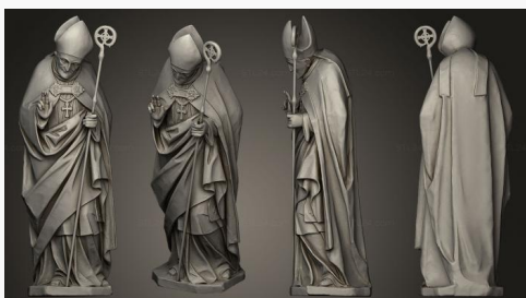
STKRL 0081 → 2500P