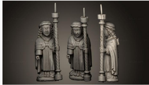
STKRL 0159 → 2500P