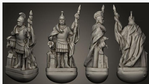
STKRL 0084 → 2500P