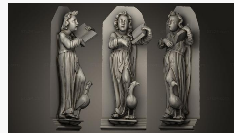
STKRL 0020 → 4900P