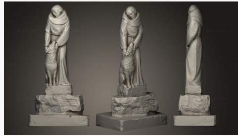
STKRL 0063 → 2500P