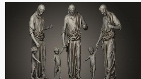
STKRL 0038 → 3900₽