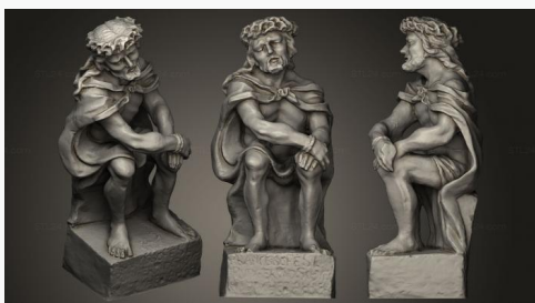
STKRL 0049 → 4900P