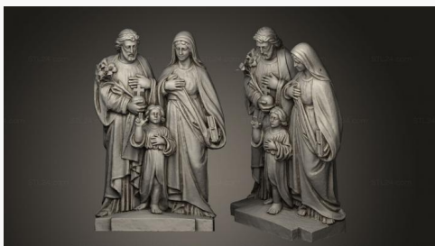
STKRL 0052 → 4900P