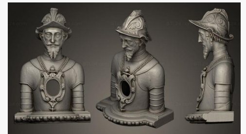
STKRL 0009 → 4900₽