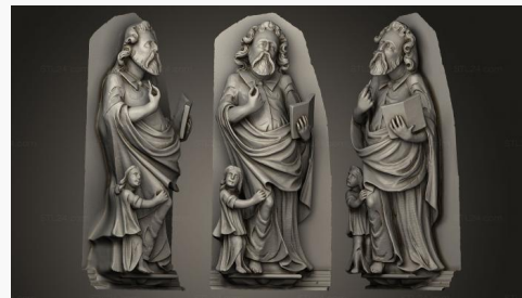
STKRL 0022 → 4900₽