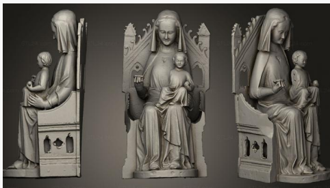
STKRL 0069 → 2500P