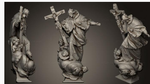
STKRL 0143 → 2500₽