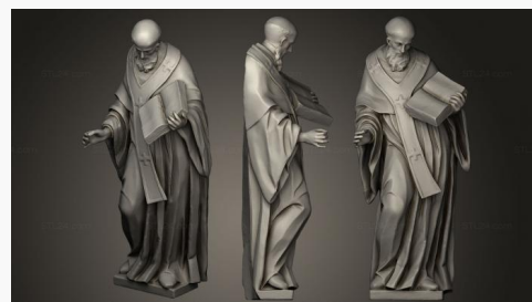
STKRL 0082 → 2500P