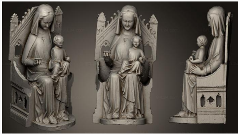
STKRL 0118 → 2500P