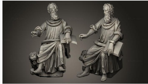
STKRL 0028 → 4900₽