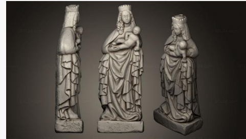
STKRL 0154 → 2500P