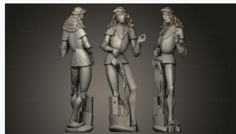
STKRL 0025 → 4900P