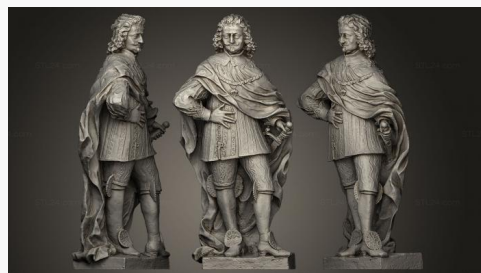
STKRL 0037 → 4900P