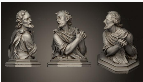
STKRL 0107 → 2500P