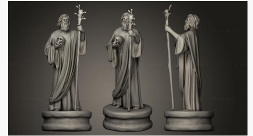
STKRL 0058 → 2500P