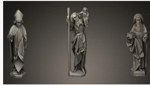
STKRL 0057 → 2500P