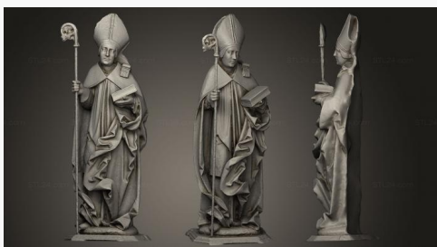
STKRL 0059 → 2500P