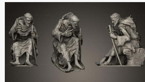
STKRL 0097 → 2500P