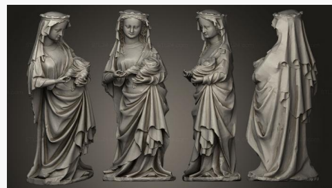
STKRL 0068 → 2500P