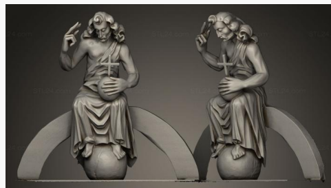
STKRL 0016 → 4900P