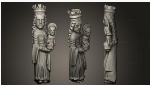
STKRL 0077 → 2500P