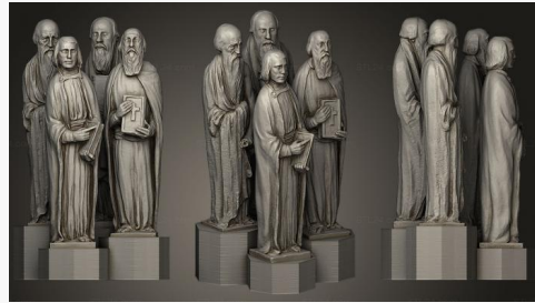
STKRL 0066 → 2500P