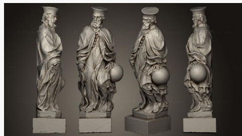
STKRL 0122 → 2500₽