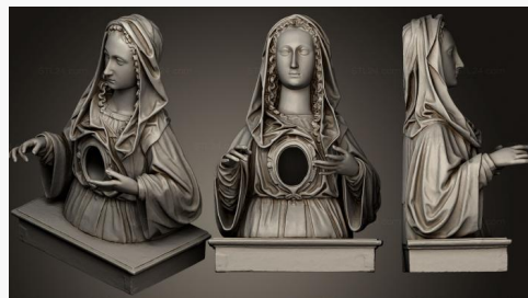
STKRL 0130 → 2500₽