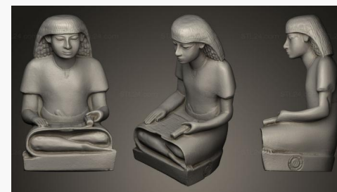
STKRL 0003 → 4900P