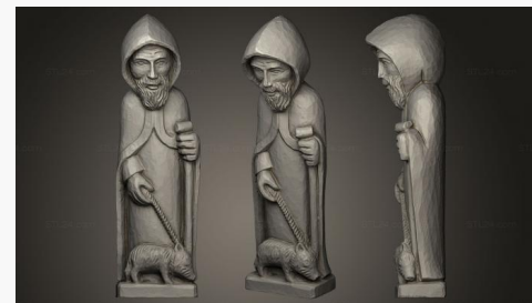
STKRL 0083 → 2500P