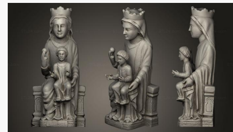
STKRL 0043 → 4900P