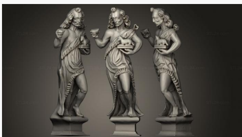
STKRL 0019 → 4900P