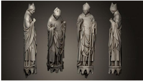
STKRL 0111 → 2500P