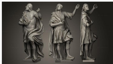
STKRL 0088 → 2500P