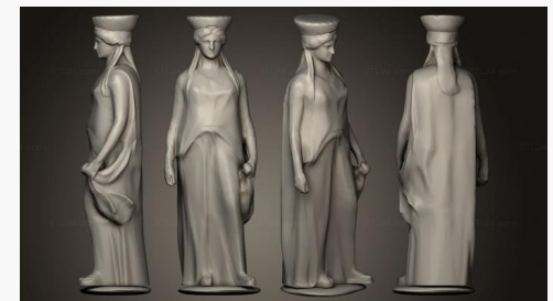
STKRL 0146 → 2500P