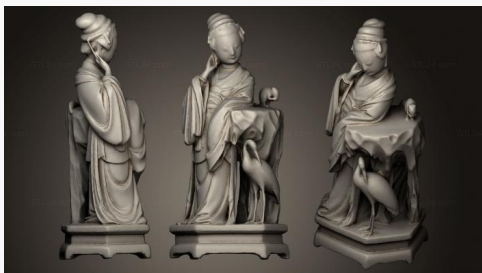
STKRL 0108 → 2500P