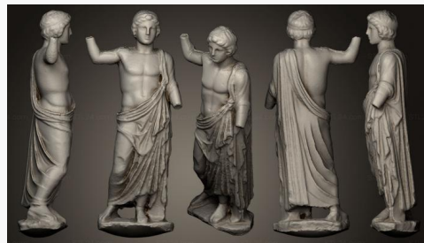
STKRL 0157 → 2500P