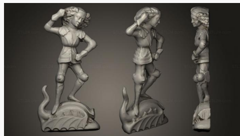
STKRL 0085 → 2500P