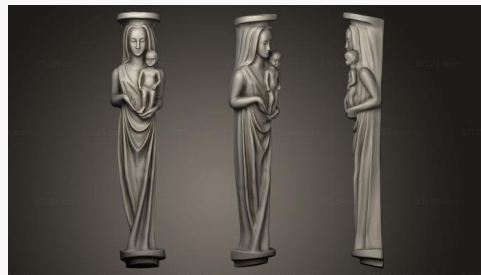
STKRL 0067 → 2500P