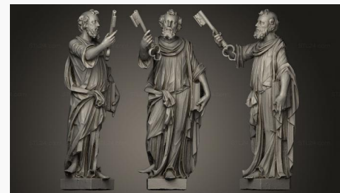
STKRL 0032 → 4900P