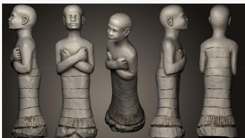
STKRL 0151 → 2500₽