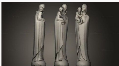
STKRL 0035 → 3900₽