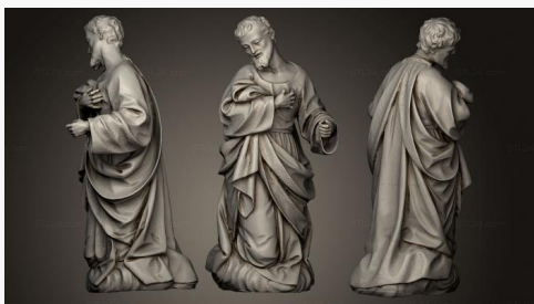
STKRL 0135 → 2500P