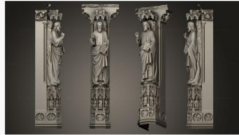
STKRL 0075 → 2500P