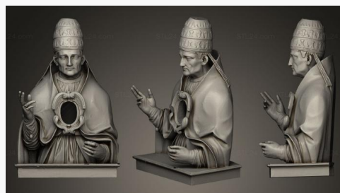
STKRL 0008 → 4900P