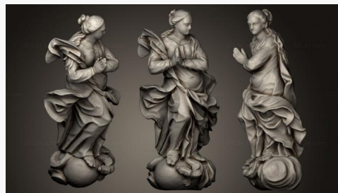
STKRL 0114 → 2500P