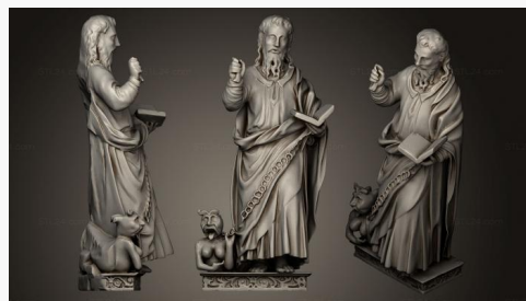
STKRL 0138 → 2500P