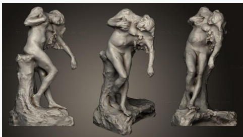
STKRL 0123 → 2500₽