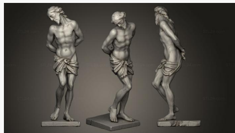
STKRL 0061 → 2500P