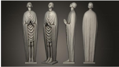
STKRL 0064 → 2500P