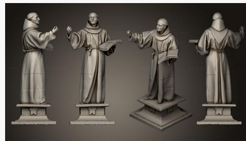
STKRL 0140 → 2500P