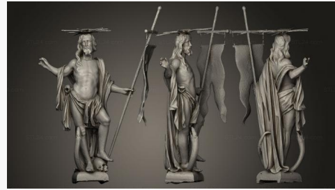
STKRL 0056 → 4900₽