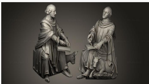
STKRL 0027 → 4900P