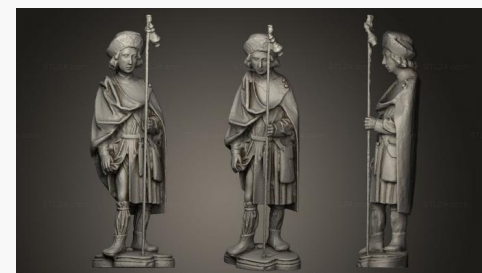
STKRL 0090 → 2500P