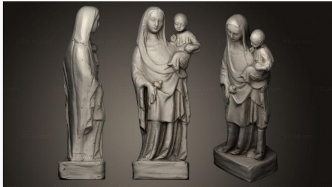
STKRL 0155 → 2500P