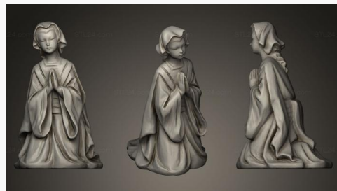
STKRL 0073 → 2500P