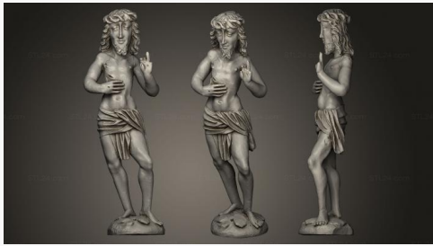
STKRL 0060 → 2500P