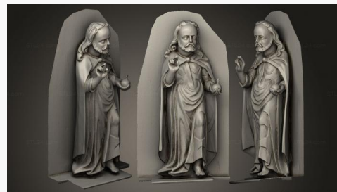
STKRL 0018 → 4900P