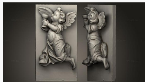
STKRL 0015 → 4900P