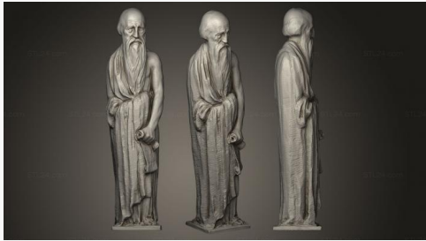
STKRL 0099 → 2500P