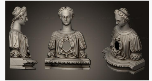
STKRL 0142 → 2500P