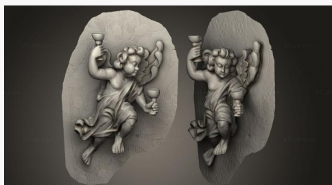
STKRL 0013 → 2900₽