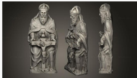
STKRL 0036 → 4900₽