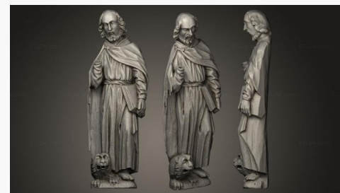
STKRL 0070 → 2500P