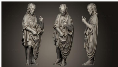
STKRL 0136 → 2500₽