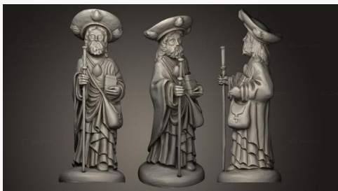
STKRL 0087 → 2500P