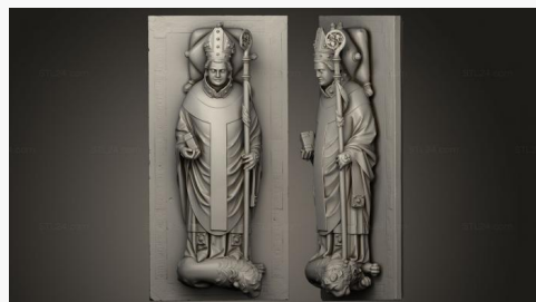
STKRL 0041 → 2900₽