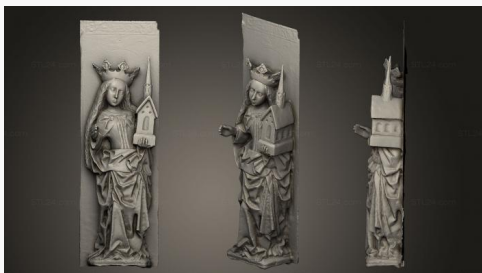
STKRL 0086 → 2500P