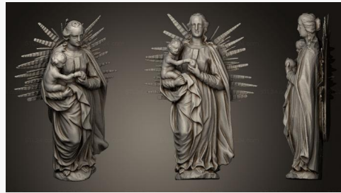
STKRL 0117 → 2500P