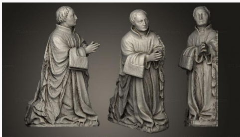
STKRL 0065 → 2500P