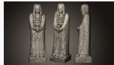
STKRL 0109 → 2500P