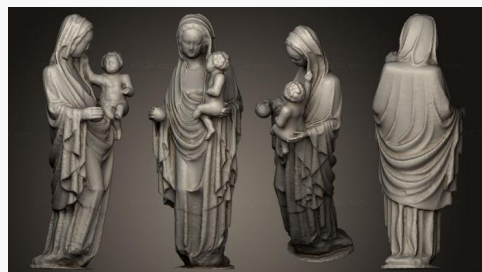
STKRL 0156 → 2500₽