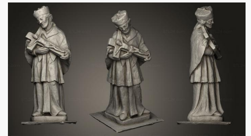
STKRL 0094 → 2500P