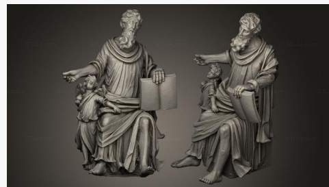
STKRL 0029 → 4900P