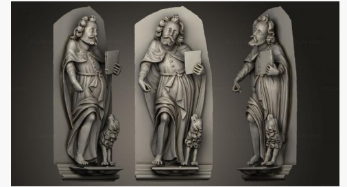
STKRL 0021 → 3900₽