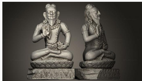
STKRL 0024 → 4900P