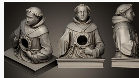
STKRL 0132 → 2500₽