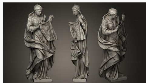
STKRL 0091 → 2500P