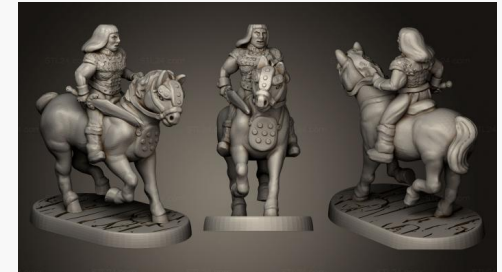
STKRL 0161 → 2500P