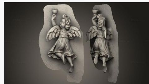
STKRL 0014 → 4900P