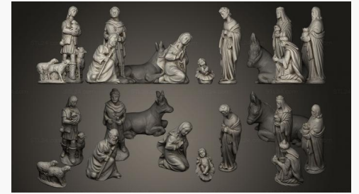
STKRL 0048 → 4900₽