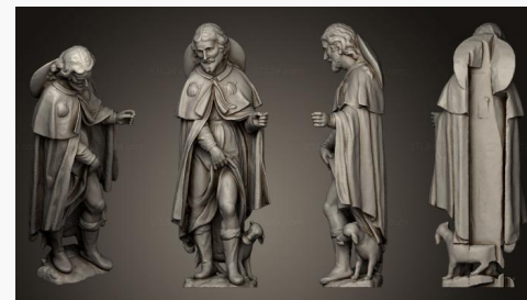
STKRL 0141 → 2500P