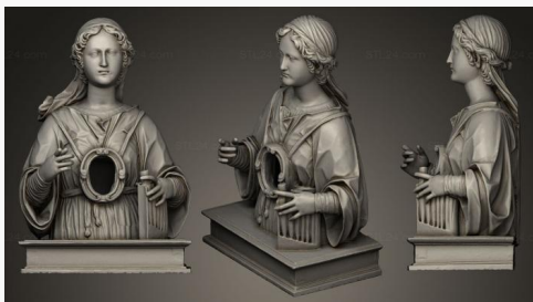
STKRL 0010 → 4900P