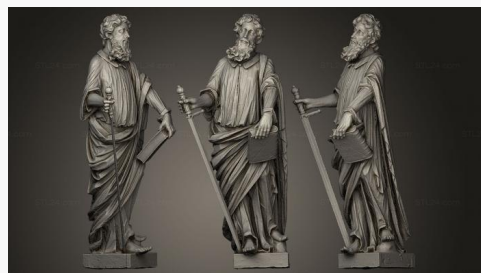
STKRL 0030 → 4900P