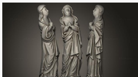
STKRL 0001 → 2900₽