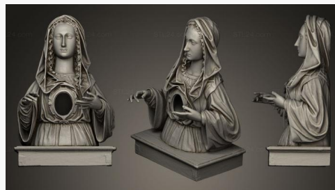
STKRL 0011 → 4900P