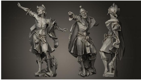
STKRL 0098 → 2500P