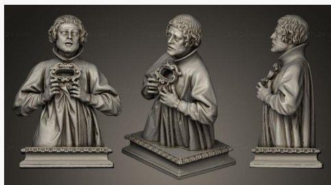
STKRL 0007 → 2900₽