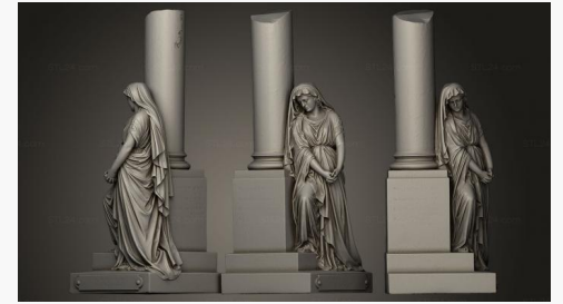
STKRL 0105 → 2500P