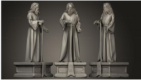
STKRL 0040 → 3900₽