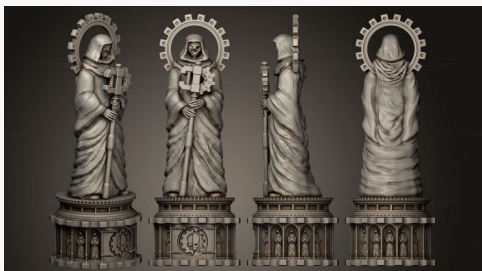
STKRL 0149 → 2500₽