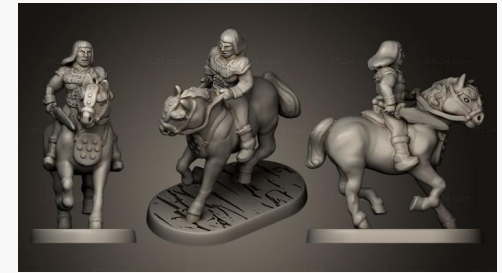
STKRL 0160 → 2500P