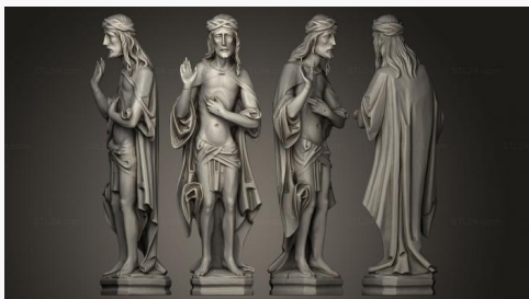
STKRL 0050 → 4900P