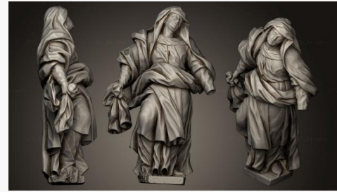
STKRL 0131 → 2500P