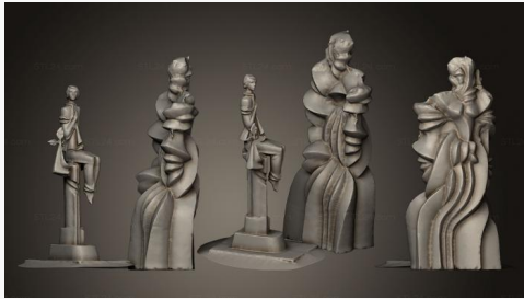
STKRL 0152 → 2500P