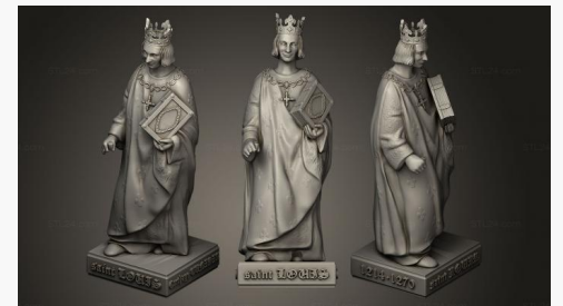
STKRL 0100 → 2500P