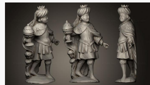
STKRL 0116 → 2500P