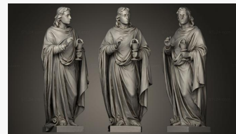
STKRL 0053 → 4900P