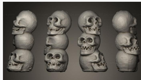
STKRL 0096 → 2500P