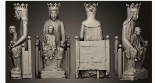
STKRL 0120 → 2500P