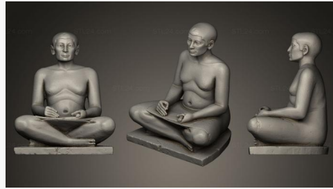
STKRL 0104 → 2500P