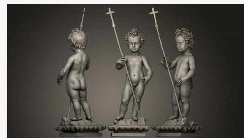
STKRL 0005 → 4900P