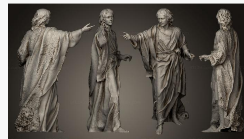
STKRL 0137 → 2500P