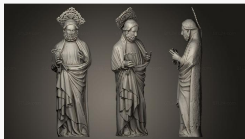
STKRL 0092 → 2500P