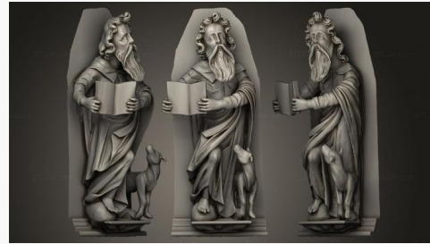
STKRL 0023 → 3900₽