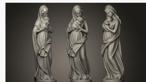
STKRL 0042 → 2900₽