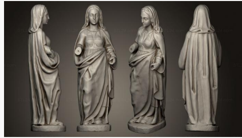
STKRL 0150 → 2500P