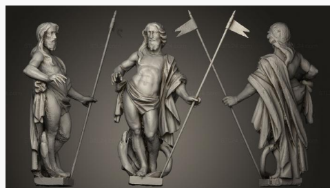
STKRL 0054 → 4900P