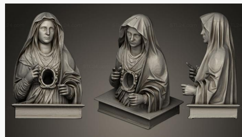
STKRL 0012 → 4900P