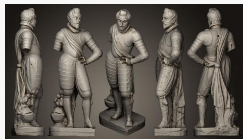
STKRL 0147 → 2500P