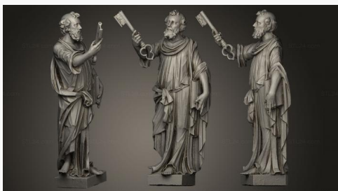
STKRL 0031 → 4900P