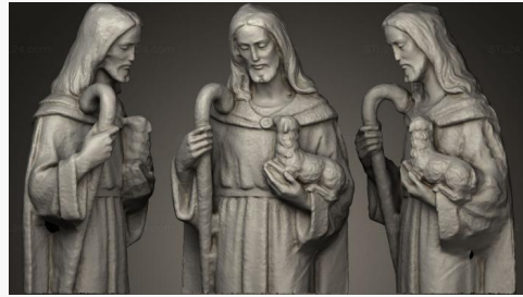
STKRL 0055 → 3900₽