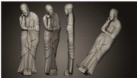
STKRL 0139 → 2500P