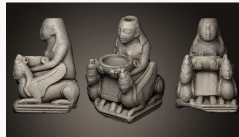
STKRL 0112 → 2500P