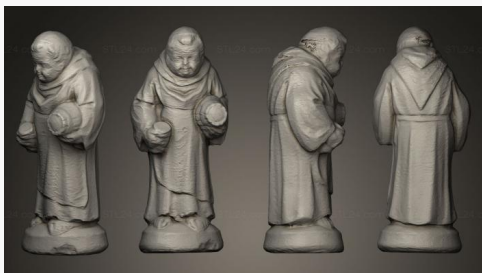
STKRL 0071 → 2500P