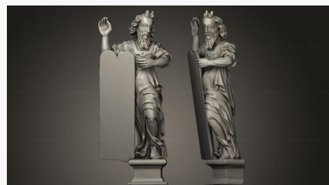
STKRL 0017 → 2900₽