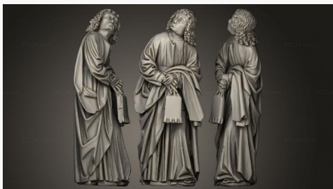
STKRL 0026 → 4900P