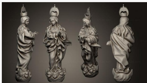
STKRL 0115 → 2500₽