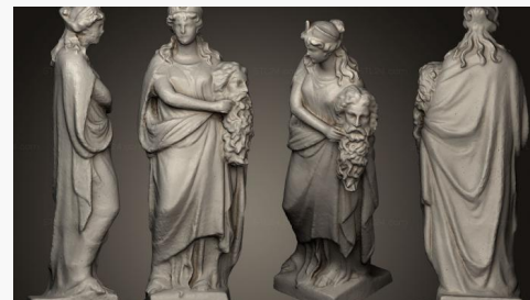
STKRL 0121 → 2500P