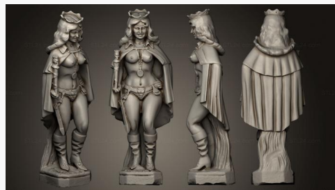
STKRL 0124 → 2500P