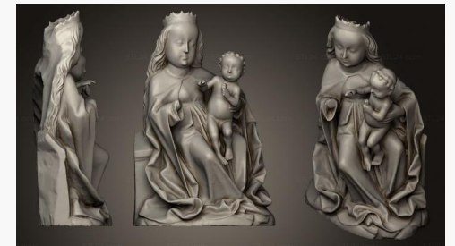
STKRL 0158 → 2500P