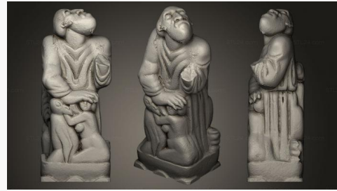
STKRL 0095 → 2500P