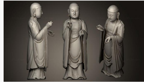
STKRL 0145 → 2500P