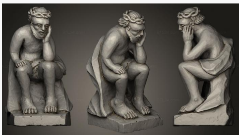
STKRL 0079 → 2500P