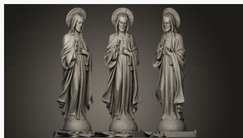
STKRL 0033 → 4900P