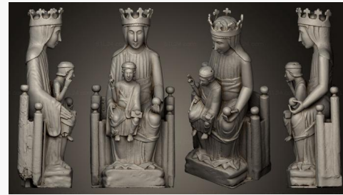
STKRL 0119 → 2500P