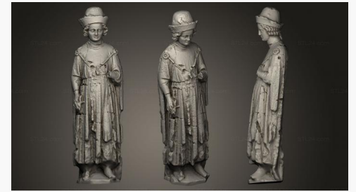
STKRL 0076 → 2500P