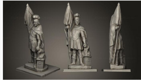
STKRL 0093 → 2500P