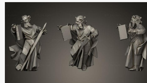
STKRL 0078 → 2500P