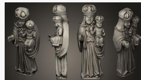
STKRL 0106 → 2500P