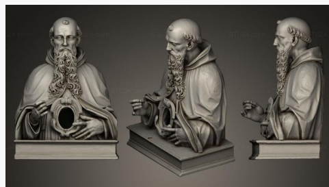
STKRL 0006 → 4900P