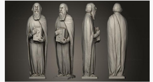
STKRL 0103 → 2500P