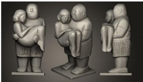
STKRL 0045 → 2900₽