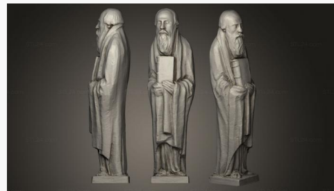
STKRL 0101 → 2500P