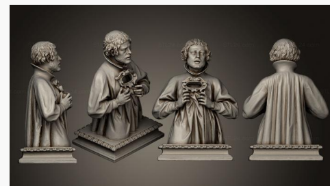
STKRL 0127 → 2500₽