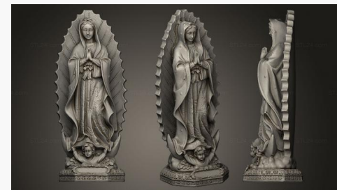
STKRL 0074 → 2500P