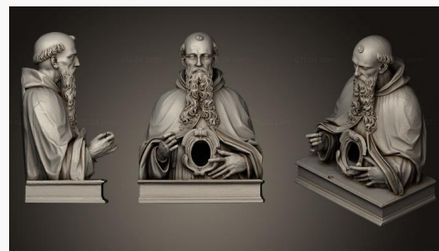
STKRL 0126 → 2500P