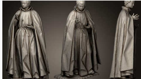
STKRL 0133 → 2500P