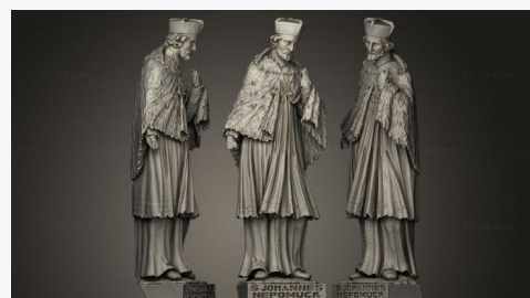
STKRL 0044 → 2900₽