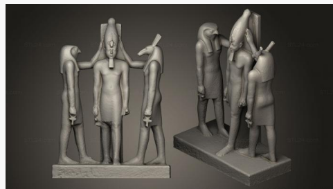
STKRL 0039 → 4900P