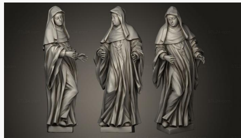
STKRL 0089 → 2500P