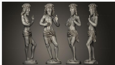
STKRL 0046 → 4900P