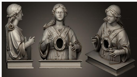
STKRL 0129 → 2500₽