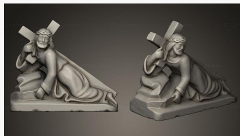
STKRL 0062 → 2500P